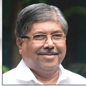
Hon. Shri. Chandrakant Patil Minister, Higher & Technical Education, Government of Maharashtra